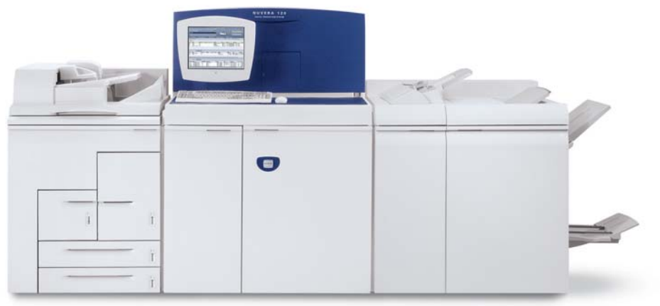
Xerox Nuvera® EA with Standard FreeFlow® Print Server, Integrated Onboard Scanner, Multifunction Finisher Pro Plus

Finishing can make or break your applications. The Xerox Nuvera® 100/120/144 EA Production System offers you many ways to finish your output – and to create high-quality, high-impact applications right at your point of need.